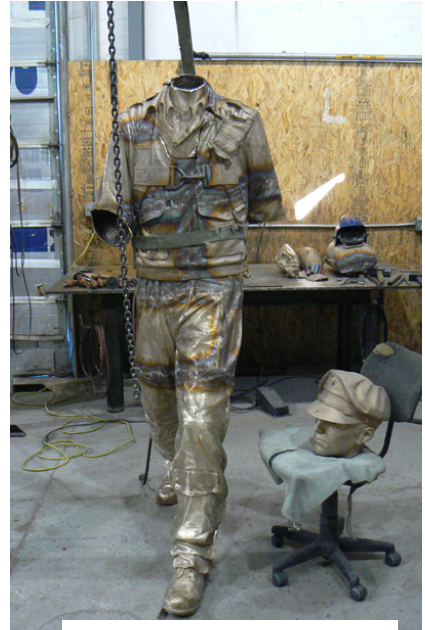
World War II Aviator in fabrication.