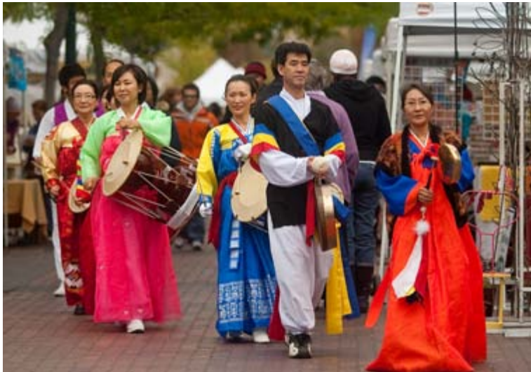
Boise Korean Dance Mission

Cultural Programs provide citizens an opportunity to connect with others and their community. Exposure to arts and culture ignites innovation, which is a powerful force that benefits Boiseans now and in the future. Cultural programs offered by the City and its partners challenge us to participate in and think about our community and its place in the world, and formulate new solutions for existing problems. We learn to appreciate the legacies of cultural patterns and become more accepting of newcomers as they arrive from all corners of the globe. We learn to imagine, take chances, and to reformulate outdated patterns. Cultural programs help learning, arts, and culture thrive in Boise.