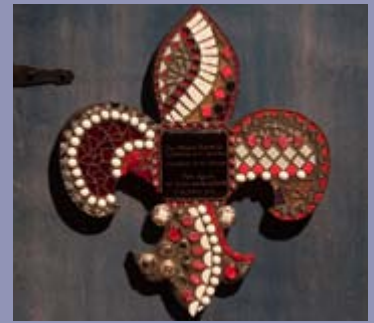
Mayor’s Awards in Excellence for Art & History Award Plaques 2009 by Mosaic Essentials