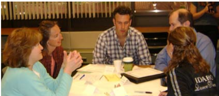
Culture Cafe, presented by Dept. of Arts & History and the Idaho Commission on the Arts

TriCA $1,500.00 "Dancing through Schools"