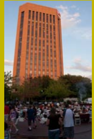
City Harvest