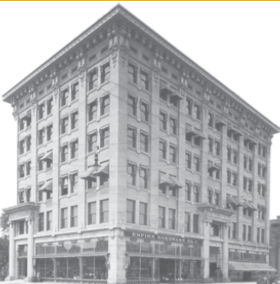
Left to Right: Empire Building, 1911, Photo by Idaho State Historical Society Neighborhood on 12th Street, Circa 1950, Photo by Lee Burn