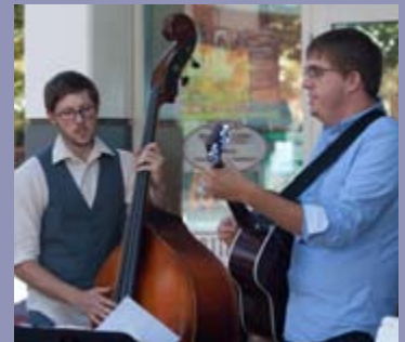
Performing Arts at the Market