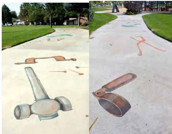
ORIGINAL COMPLETED WORK