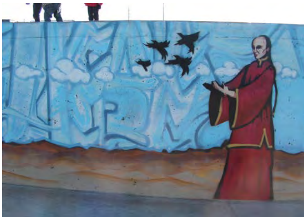
ORIGINAL COMPLETED WORK