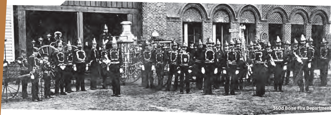
360d Boise Fire Department

historic and cultural events, and make it easy for community members to appreciate Boise's heritage