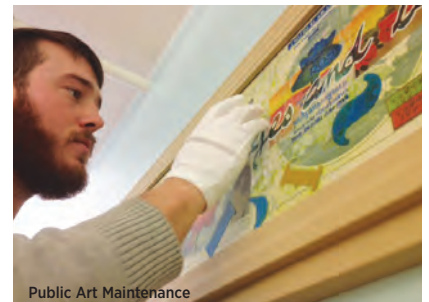
Public Art Maintenance