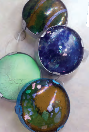
River Sculpture – Bubbles