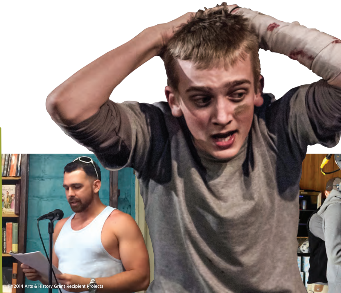
FY2014 Arts & History Grant Recipient Projects

Idaho Shakespeare Festival also continued as the City's Cultural Ambassador for a second year and received a $15,000 award from the City's Economic Development Fund.