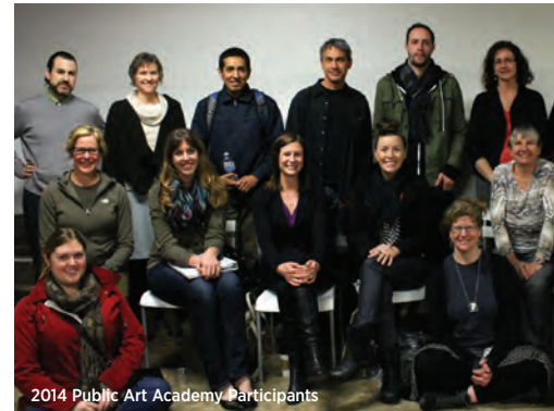
2014 Public Art Academy Participants

Two recommended de-accessions; Philippi Park and McDevitt Park