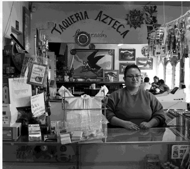
Azteca Market by Allison Corona, Boise Visual Chronical

Boise City invites artists to apply for the opportunity to have artwork purchased and accessioned into the City of Boise’s Public Art Collection. Artists are invited to apply with existing artwork that is unframed and currently available for purchase.