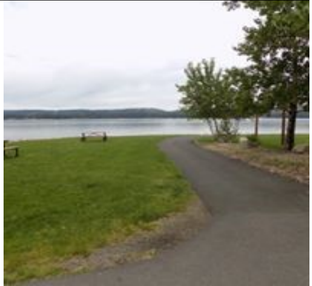
Brown Park, former mill site.