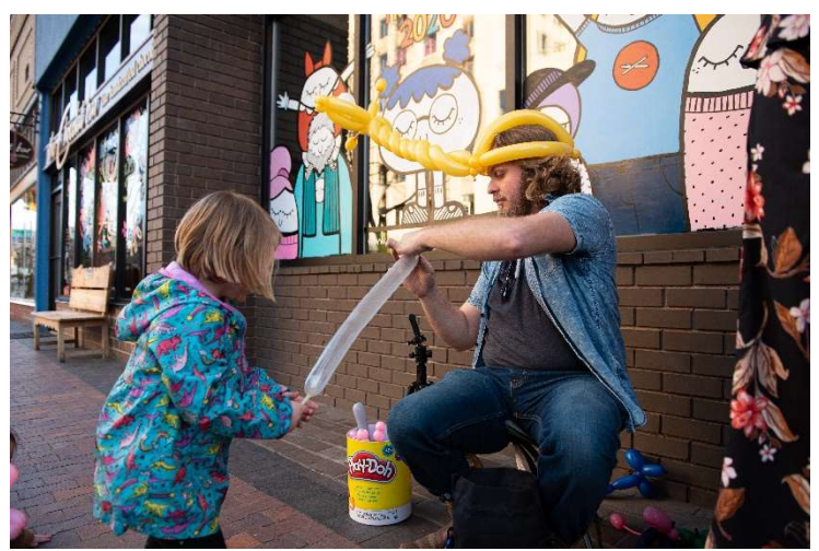
Balloon Animal Artist, March 2020 First Thursday

All projects could be documented by DBA staff and/or DBA contractors through