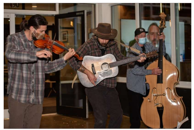
The Aldape Bootstompers, November 2020 First Thursday

The goal of roving performances at First Thursday is to activate Downtown Boise providing an element of surprise and whimsy for downtown patrons while highlighting Boise's contemporary art community.