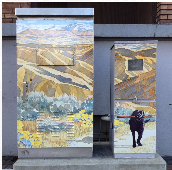
Bringin' It Home (2012) by Sandra Shaw

Artists will be selected by a selection panel, and the panel may select up to 12 artists or artist teams to implement their design concept. Selection panelists may give preference to artists that are not currently represented in the Traffic Box Collection. Local artists are strongly encouraged to apply.