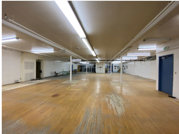
Records center, first floor, clear out of boxes and shelving