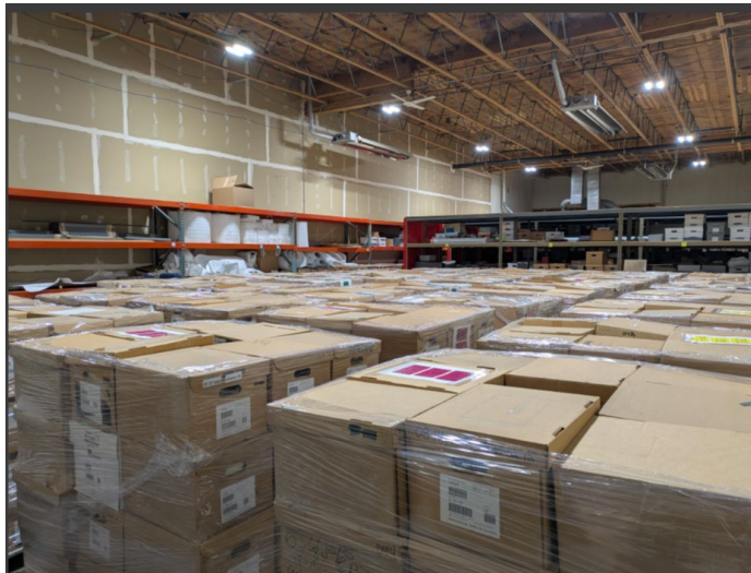
City Archives, consolidation and clear out for temp storage